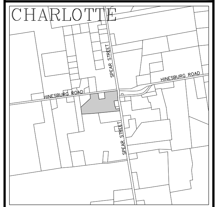
LOCATION MAP 1" = 2000'

PROJECT: PROPOSED 3 LOT SUBDIVISION 2760 SPEAR STREET CHARLOTTE VERMONT